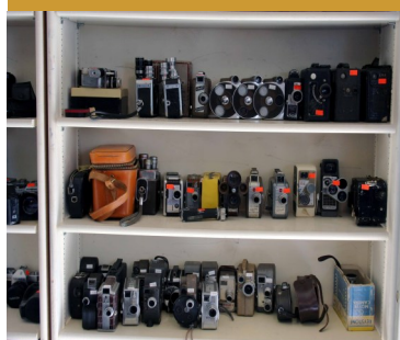
Movie camera 8 & 16 mm